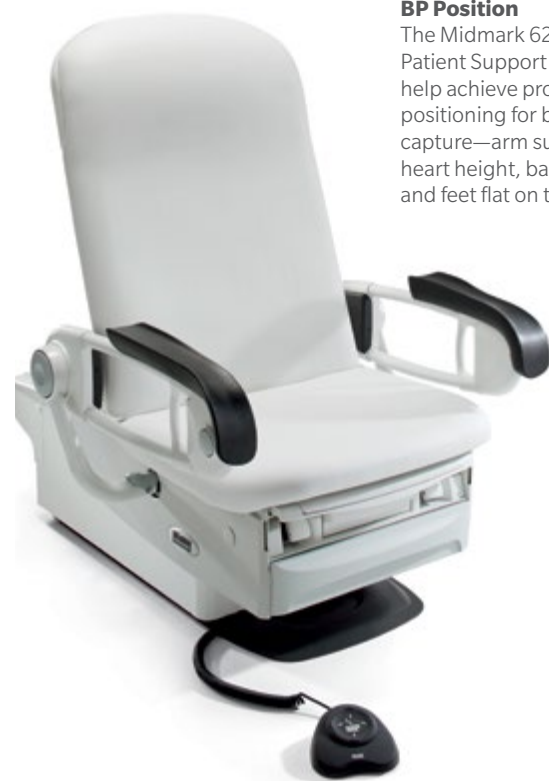
BP Position The Midmark 627 with Patient Support Rails Plus™ help achieve proper patient positioning for blood pressure capture—arm supported at heart height, back supported and feet flat on the floor.