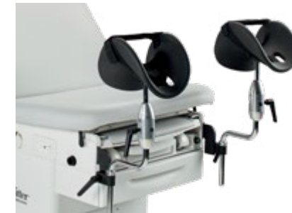
Articulating Knee Crutches The unique ball-socket design allows for a maximum range of adjustment, designed to ensure optimum knee and leg support. Available in a non-articulating option.