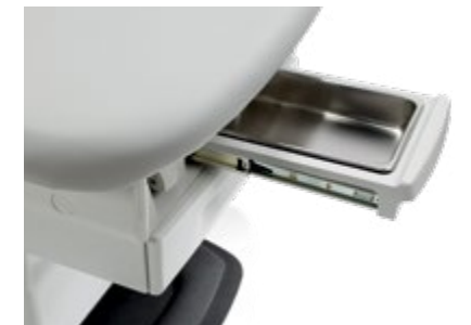
Stainless Steel Treatment Pan Ideal for lower-body procedures or other situations in which removal of fluid and debris is necessary.