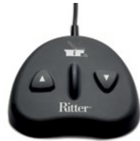
Foot Control Standard foot control designed to make patient positioning quick, effective and always within reach. (224-011 foot control shown)