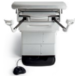
Stirrups and Pelvic Tilt Help position patients properly and comfortably for lower-body examinations.