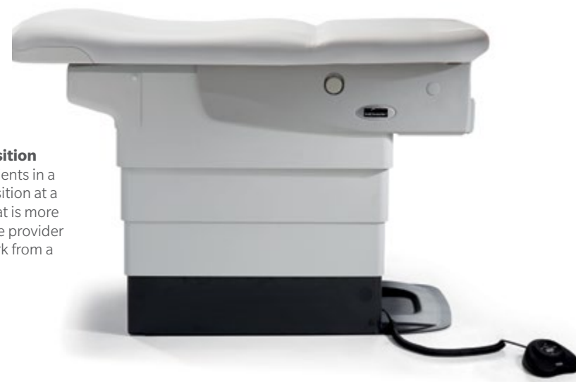
Elevated Flat Position Easily position patients in a supine or Sims position at a working height that is more comfortable for the provider who prefers to work from a standing position.