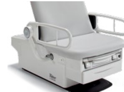
Patient Support Rails™ Provides patients with a 1¼ inch diameter continuous gripping surface for entering, exiting or repositioning on the exam table.