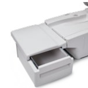
Supply Assistant Provides extra storage for bulky exam supplies. Keeps drapes, gowns and similar items within easy reach.