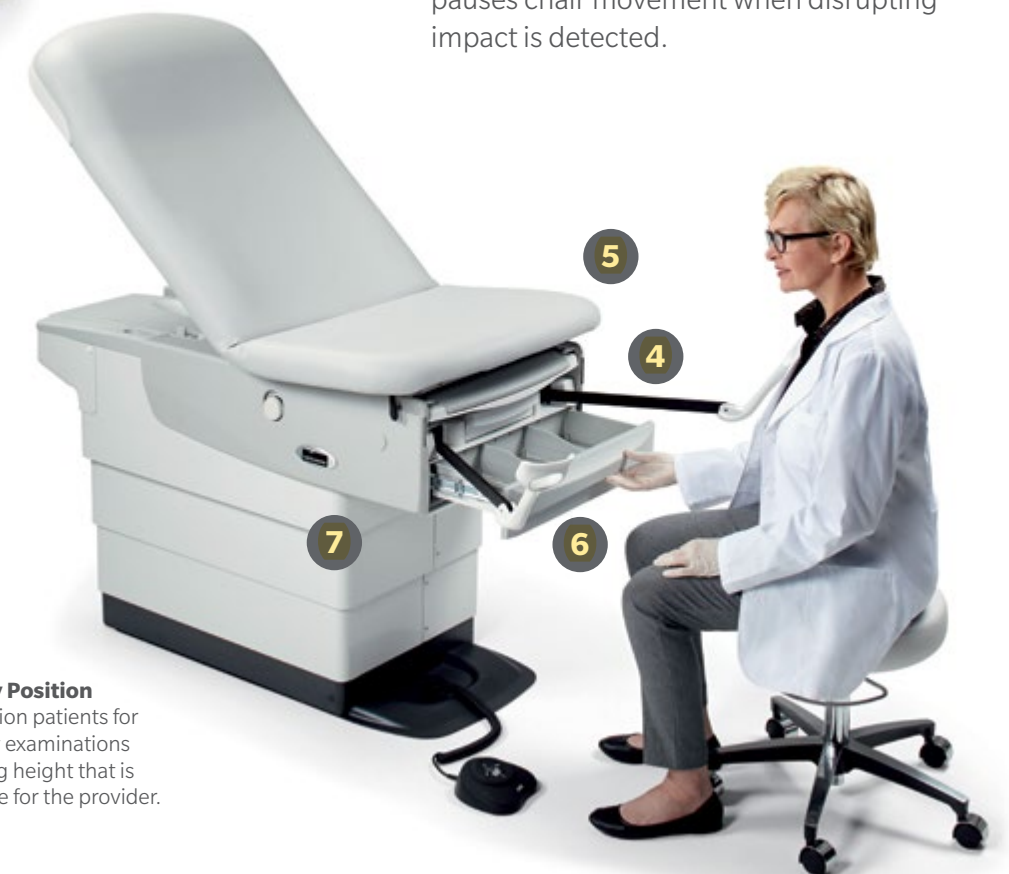
Lithotomy Position Easily position patients for lower-body examinations at a working height that is comfortable for the provider.