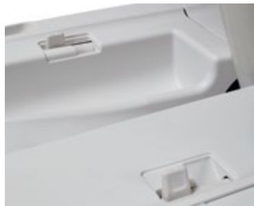
Clean Assist™ Roller System The retractable roller base allows you to easily and safely move the chair for cleaning. (available on the 627-011 model only)