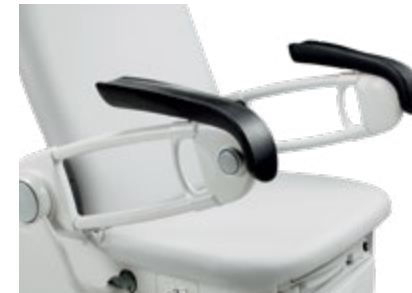
Patient Support Rails Plus™ Helps achieve proper positioning of the patient's arm for blood pressure capture.