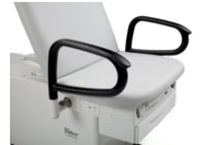
Assist Arms Designed to offer patients a stable gripping surface for accessing the chair and a sense of security during positioning.