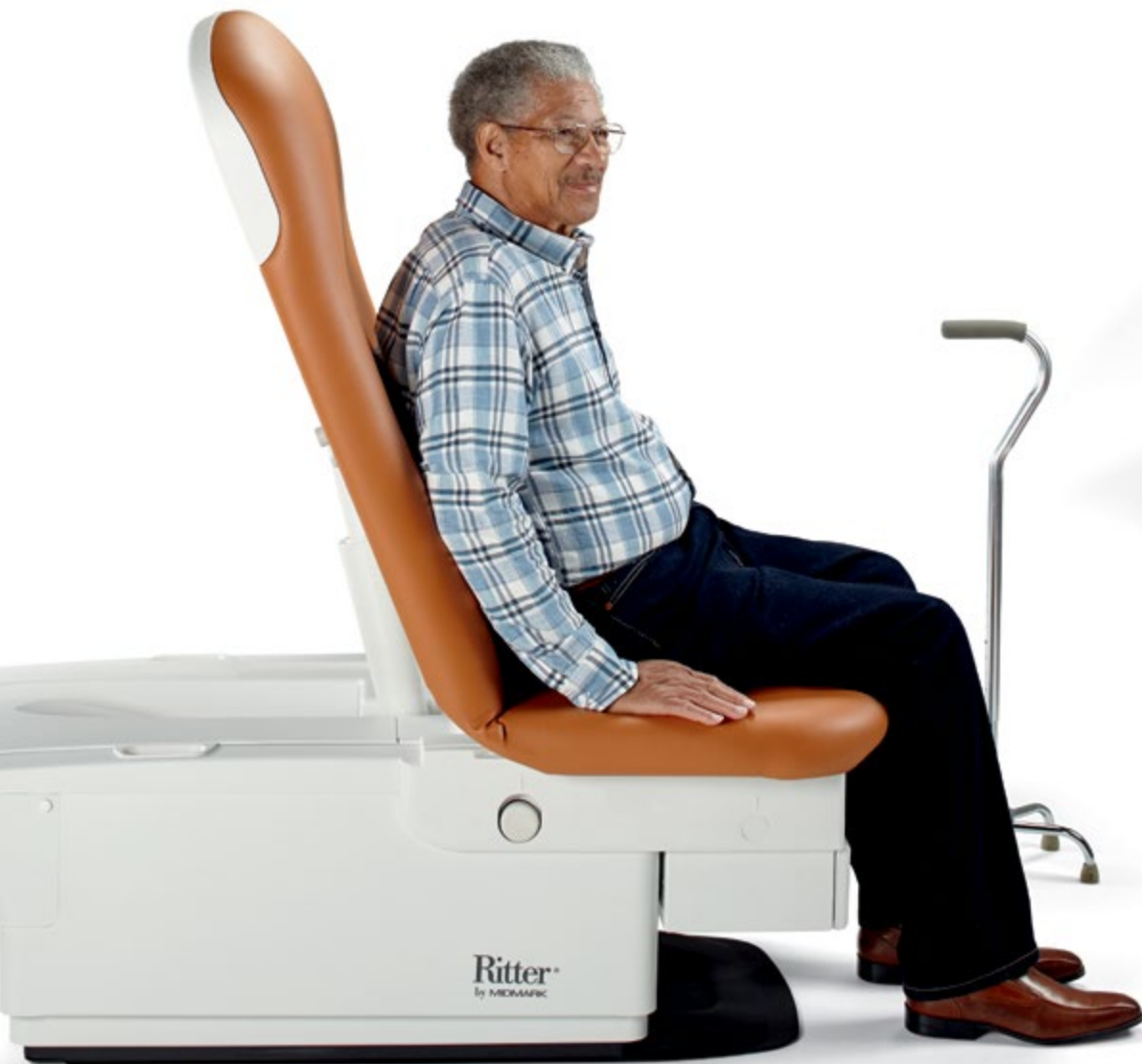
Ritter 224 Barrier-Free® Examination Chair

A low seat height of 46 cm (18") and wide, flat transfer surface enable patients to transfer onto and off of the exam chair with minimal assistance.