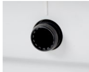
Accessory Receivers Standard receivers are designed to make the integration of accessories easy and efficient—no tools required.