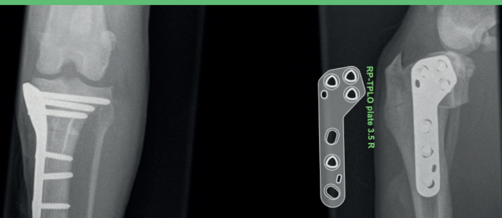
RP-TPL O plate 3.5 R

cycle options available in the user menu.